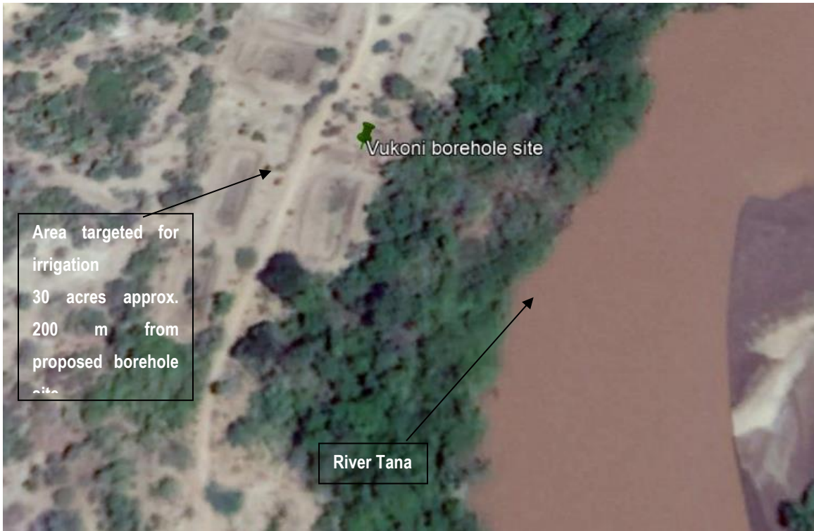
Fig-1: Google map extract showing the Location of Project Area